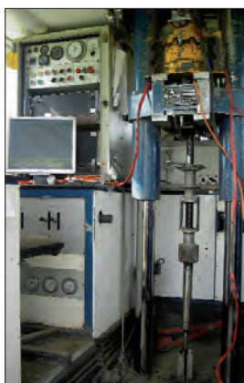
CPT interior with in-situ vane shear testing equipment

out, with more tests planned before completion of the piling program. The working piles are grouted after the test and incorporated into the bridge foundations.