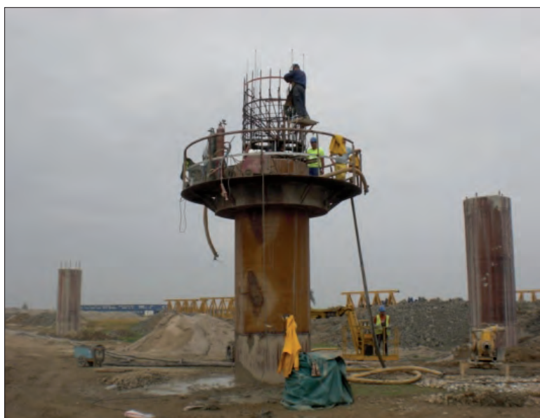
Installation of O-cell test pile

FUGRO CONSULT GMBH Wolfener Strasse 36 V 12681 Berlin, Germany Tel. +49-(0)30-93 651 364 e-mail fugro@fugro.de www.fugro.de