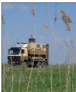
CPT truck and bridge construction site

The Vidin-Calafat-Bridge is a newly planned road and railroad bridge linking the cities of Vidin, Bulgaria and Calafat, Romania. It will be the second bridge on the shared section of the Danube between Romania and Bulgaria. The bridge is to be built by the Spanish company Fomento de Construcciones y Contratas (FCC), and the cost is projected to be $160 million. Construction officially began on May 13, 2007 in Vidin and is planned to finish by 2010. The bridge will be part of Pan-European corridor IV (Dresden–Istanbul) and will measure 1,971 meters in length. The construction of this bridge is one of the major infrastructural projects in this region. These development corridors are distinct from the Trans-European transport networks, which include all major established routes in the European Union, although there are proposals to combine the two systems, since most of the involved countries now are members of the EU.